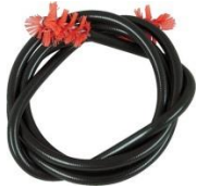
SNAKE BRUSH (VINYL-COVERED METAL)