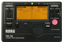
KORG TM50 TUNER/METRONOME